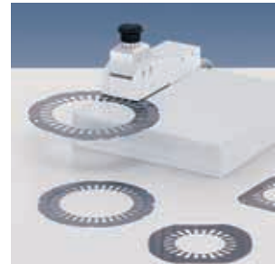
Punched part sensor