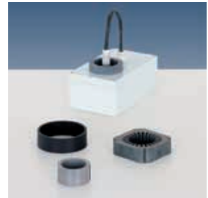
Ring core sensor