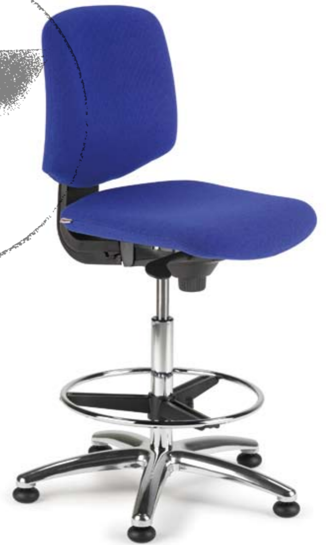
MD 246 AS (H 53÷72)