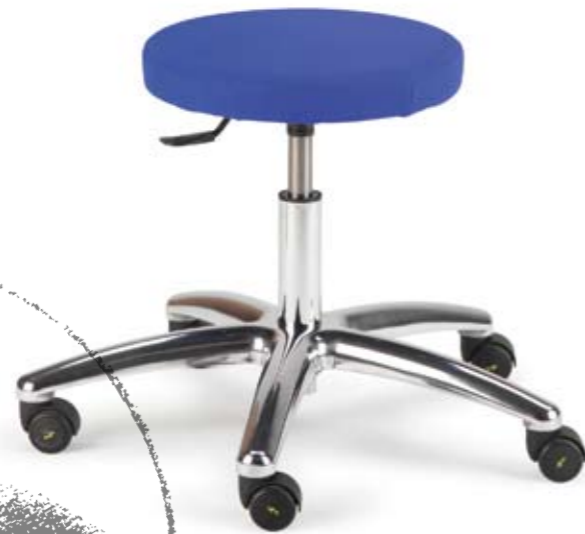
VL 141 AS