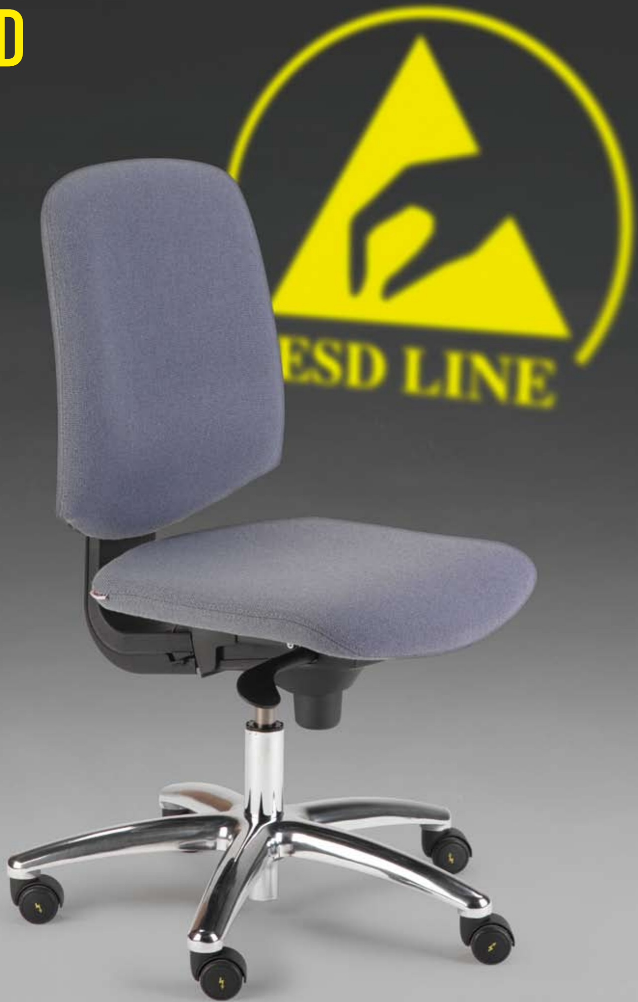
MD 115 AS