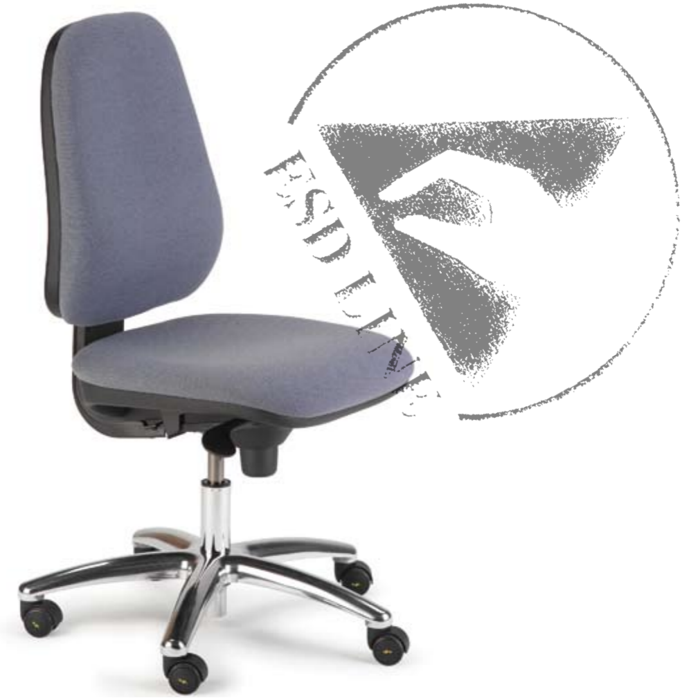
VL 115 AS