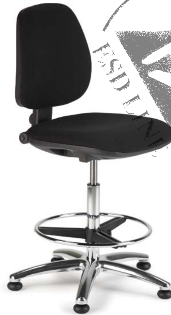
VL 146 AS (H 53÷72)