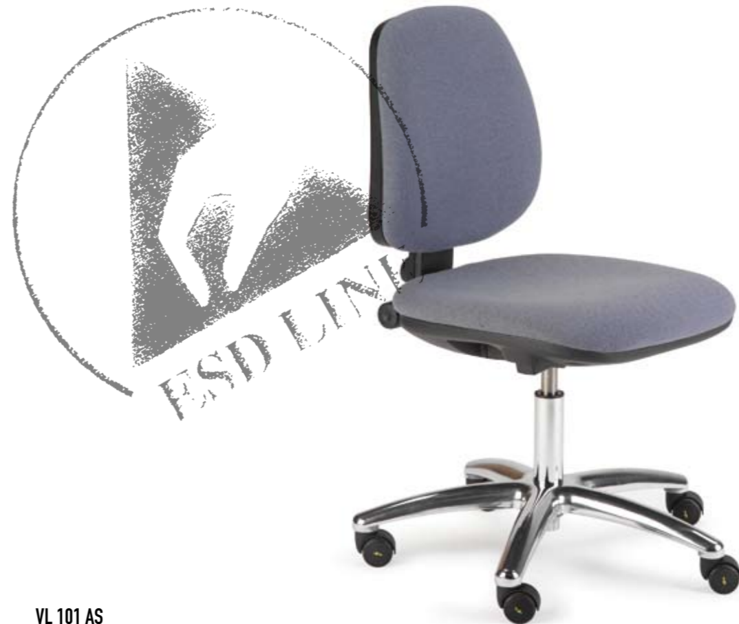
VL 101 AS