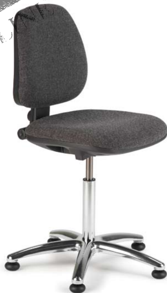
VL 147 HAS (H 68÷87)